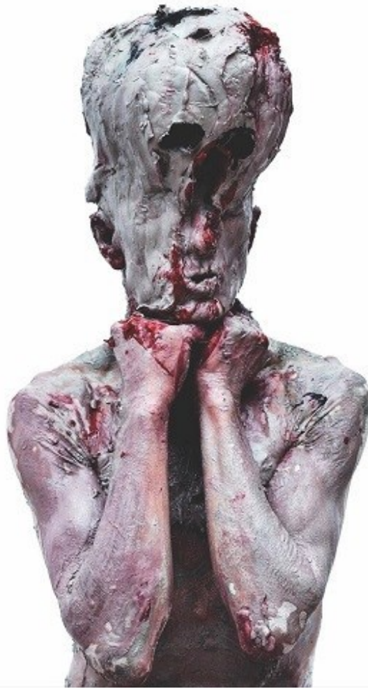
Transfiguration, a profoundly affecting study into the human existential quest.

Fortunately, the spectators who left Hybridation with a heavy heart would have the opportunity to cheer up two hours later with the solo piece Transfiguration . Employing his characteristic method of creating a living sculpture out of his own body, the artist sets out on a journey to discover the essence of the human presence and the ultimate meaning of life through successive stages of transfiguration: into an animal, a spirit/demon, a monster, a hybrid posthuman entity. A series of masterly staged breakdowns (in the human), breakaways (from the physical), and breakthroughs (toward the spiritual beyond), allow the sculptor/sculpture and the spectators to confront and be strangely emboldened by the truthfulness of ugly distortion which echoes the truth of existential agony. Alas, the wandering/wondering creature soon realizes that even as bird it cannot fly, even as spirit it cannot abandon human need, even as monster it cannot defeat fear, even as hybrid it cannot be free of identity. Raging with despair, it thrashes around and against the background of metal walls—the bars of its proverbial cage. Yet, by the end of the piece the very source of despair emerges as a source of energy, as the cradle of possibility. The human manifests the species' triumphant resilience. While it cannot go on, it will go on—Beckett's influence hard to miss. And we can all stop holding our breath.