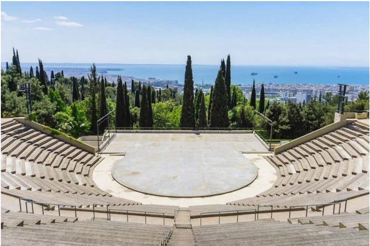
Forest Theatre (or Theatro Dassous ), Thessaloniki, Greece.

In 2015, the National Theatre of Northern Greece (NTNG) collaborated with the Hellenic Festival to organize the first Forest Festival of Thessaloniki in an effort to enhance the outreach and diversity of local theatre. In 2017, a two-week International Festival was added to the Forest Festival. The nascent institution has sought to introduce new theatrical approaches, trends, and directions that are under-represented in Greek theatre. Four productions hosted by the 2 nd International Forest Festival testify eloquently to that.